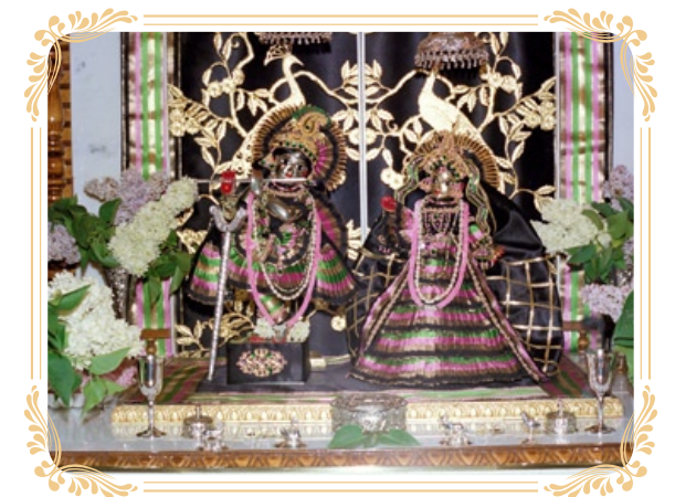
Sri Sri Radha-Banabehari in Their first four outfits