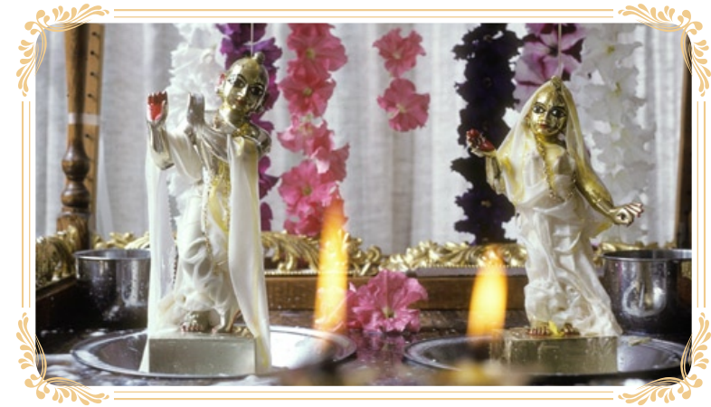
Sri Sri Radha-Banabehari's installation abhisheka